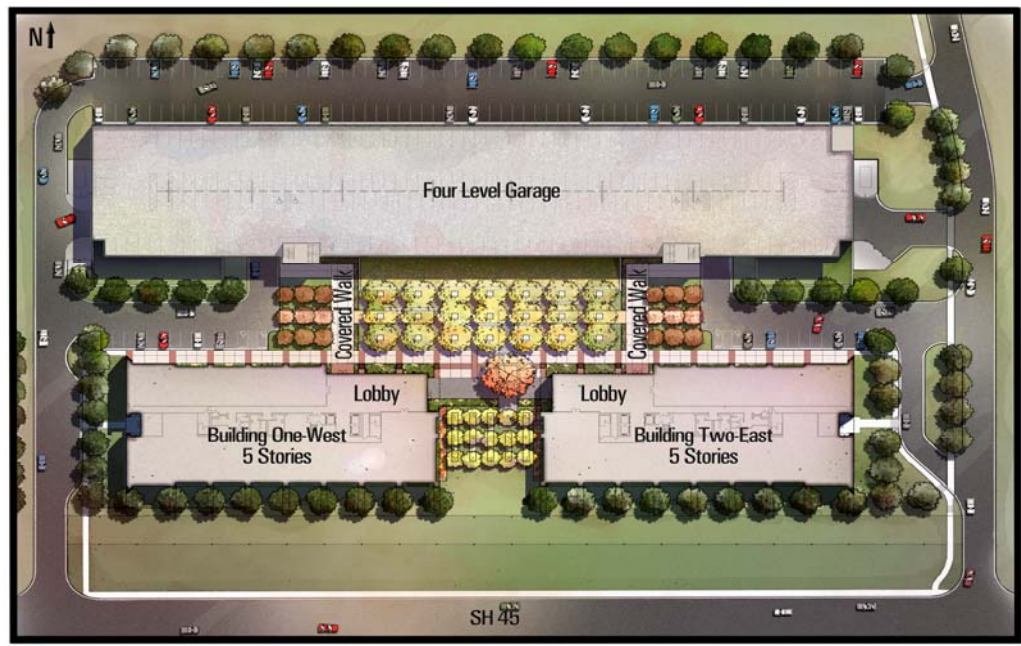
Phase I Office Site Plan